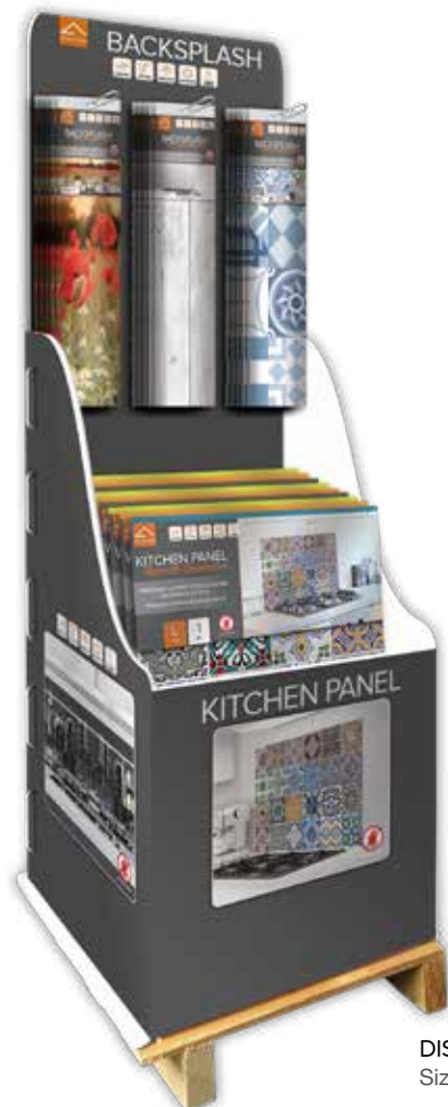
DISPLAY - Backsplashes & Kitchen Panels Size: H 149 cm x P 42cm x L 53cm

We offer a premium product water, moisture and heat resistant: a modern technology linked with ease of use and design .